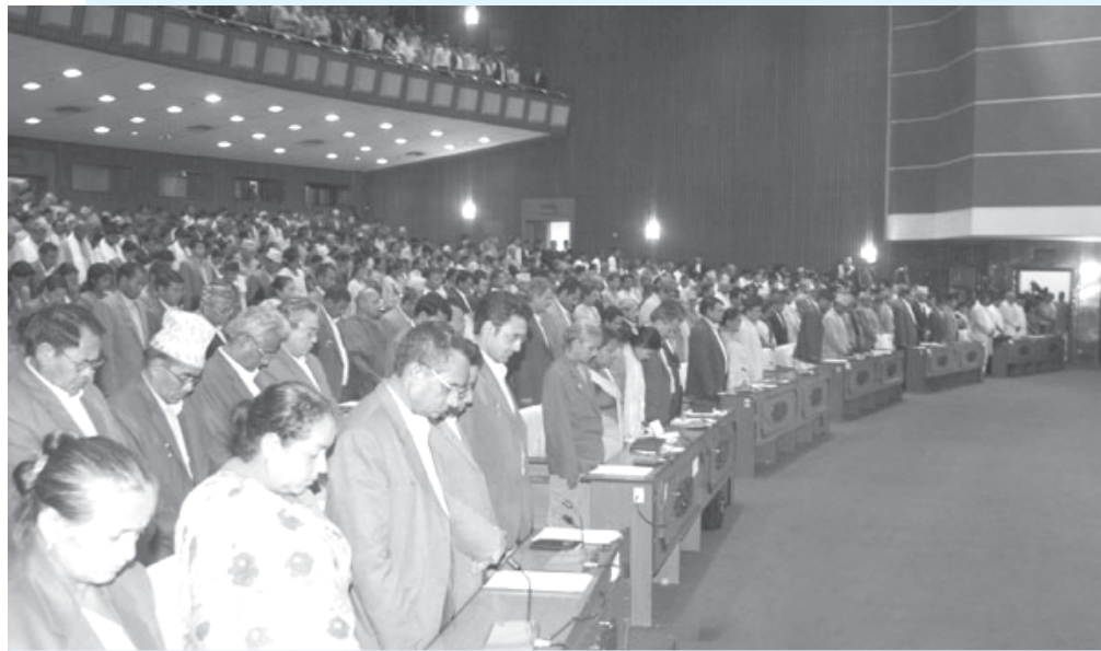
Members of the Constituent Assembly (CA) in the first meeting of CA formally declaring Nepal a Federal Democratic Republic on May 28.

With this, Nepal has entered a new momentum to frame a new constitution through CA members for the first time opening up various avenues to chart out a prosperous and noble Nepal. The successful holding of the CA elections despite numerous challenges and strenuous tasks is highly appreciable and daunting.