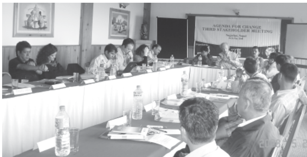
The third meeting of Agenda for Change process for freedom of expression held in Nagarkot from 24-26, May.

The comprehensive report of the agenda for change of freedom of expression in Nepal is being developed and its international launching ceremony would take place in Kathmandu on the distinguished participation of national and international personalities.