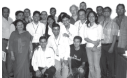
Participants after the completion of training of trainers on freedom of expression held in Kathmandu from May 21-22.

Trainers from civil society organizations and public bodies in Nepal participated in a training of trainers workshop on May third week on freedom of expression hosted by ARTICLE 19, Freedom Forum and the Federation of Nepalese Journalists in Kathmandu. The third and final meeting of the Agenda for Change, in which a panel of high level representatives of different sectors of society gathered to formulate policy recommendations for strengthening freedom of expression in the country, was also held last week.